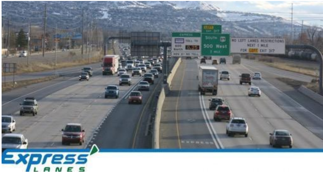
FIGURE 4: I-15 Near-Continuous Access to Managed Lanes