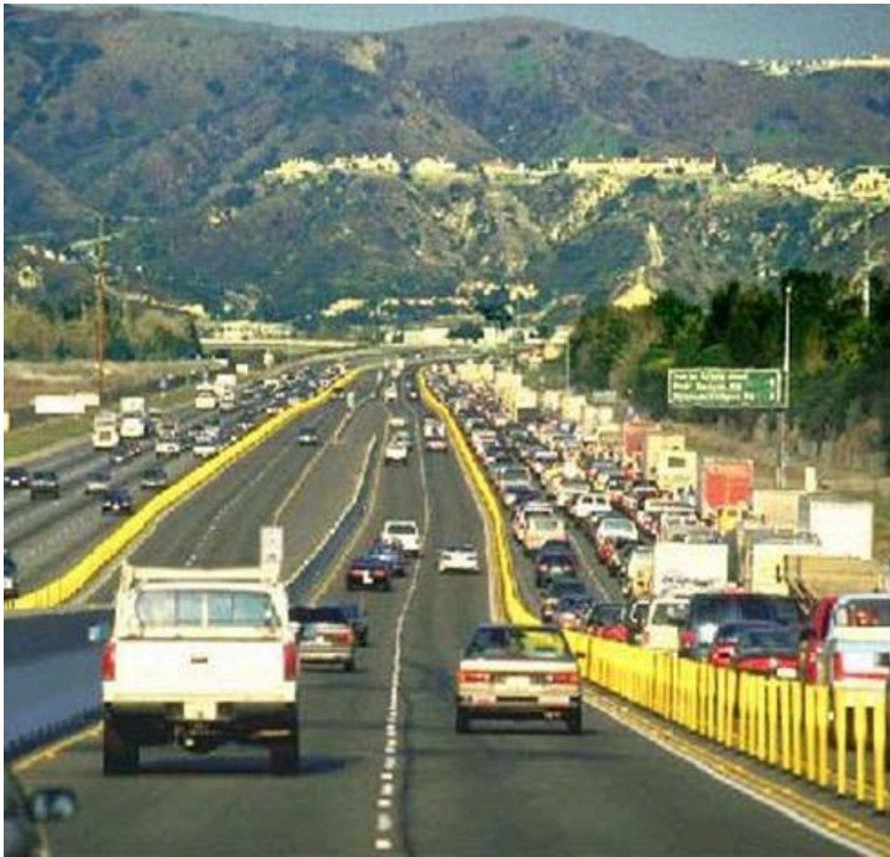
FIGURE 3: State Road 91, Orange/Riverside Counties, California, 2011.

Studies show the two managed lanes typically carry just as much traffic in the peak period as the four unmanaged general-purpose lanes. The vehicles in the managed lanes are traveling at three times the speed of the vehicles in the unmanaged lanes during the peak hour, 60 miles an hour versus 28 miles an hour.